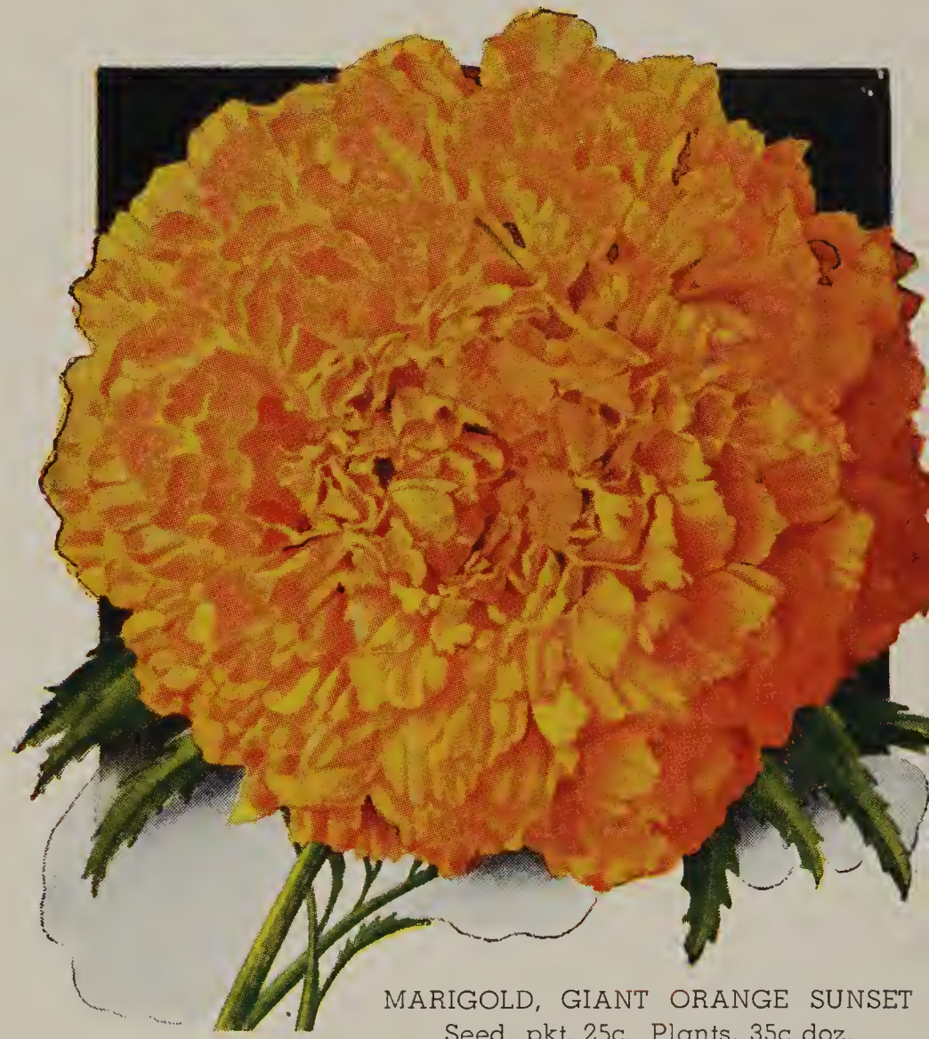
MARIGOLD, GIANT ORANGE SUNSET Seed, pkt. 25c. Plants, 35c doz.

FLORISTS AND SEEDSMEN . . . WENATCHEE, WASH.